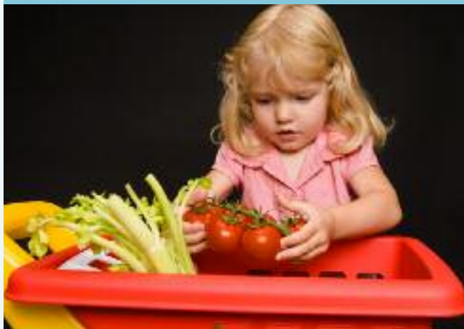
See complete Fall Food Roundup pick-up schedule at www.lbch.org

Kenner Harahan Rio Vista Metairie Memorial Pontchartrain Mandeville Covington