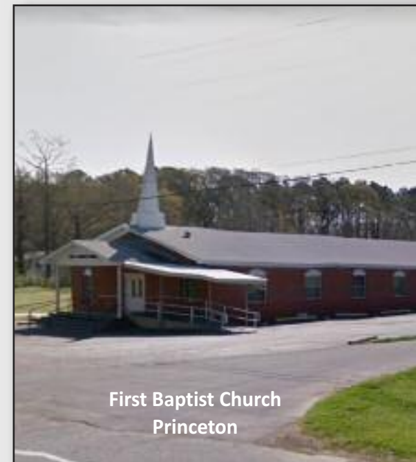
First Baptist Church Princeton

Thank You Louisiana Baptists for Meeting Needs and Changing Lives!