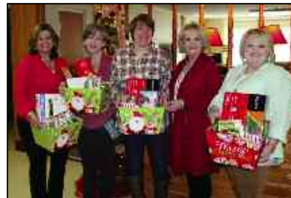
First Baptist Church, Rayville