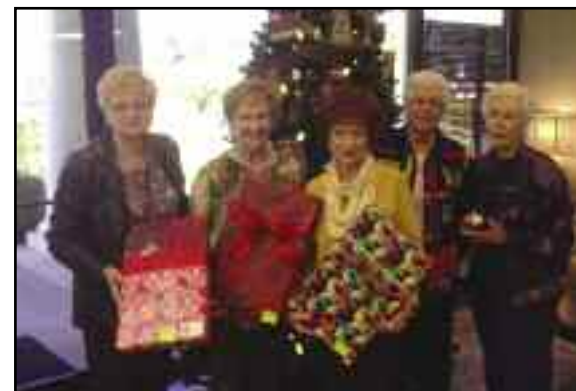
Summer Grove Baptist Church, Shreveport